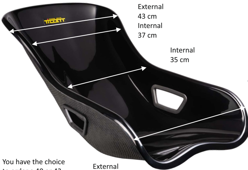
W3 recommended mounting points when fitting without integral back frame